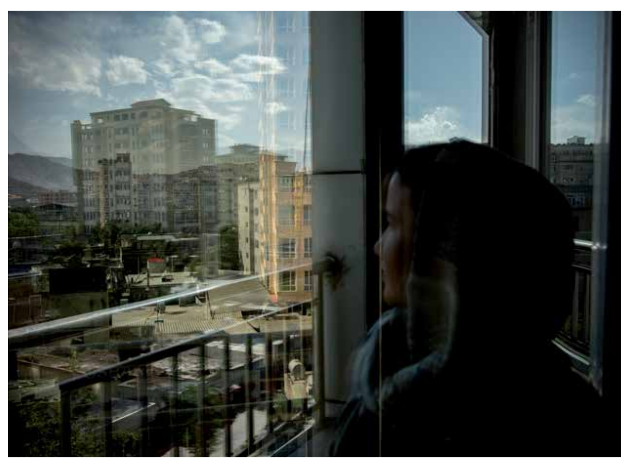
An Afghan woman poses for a portrait in her home.