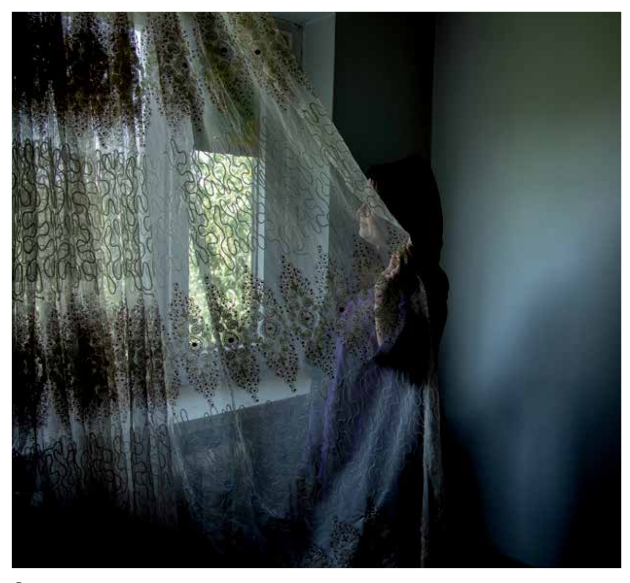
An Afghan woman poses for a portrait in her home.

Donor states must ease existing financial restrictions on Afghanistan, which are blocking the provision of healthcare, food and other essential services. They must also strengthen systems for the equitable and adequate distribution of urgent financial support and humanitarian aid in consultation with UN agencies, NGOs and humanitarian agencies operating in Afghanistan, local women activists, and organizations supporting other at-risk groups.